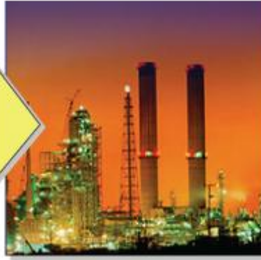
Transportation & Refining/Processing