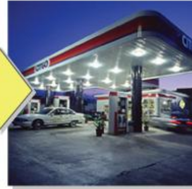
Distribution & Retail Sale

Due to the nature of the oil and gas business, with operators, contractors and ancillary third-party organisations forming transient alliances across an increasingly global marketplace, the oil and gas value chain is more fragmented than most. Fragmentation leads to unintended inefficiencies which then have consequences for the bottom line and threaten business sustainability.